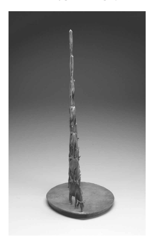
Figure 2. Side view of Segue . Dimensions of cows (bottom-to-top, length × width):

Figure 2 is a side view that reveals the secret that makes these illusions possible. The sculpture is not completely in the round; instead the 'squashed' cows are much narrower than they seem from the front and back views. They are actually carved in relief to give the illusion of roundness. The cows also line up on top of each other, instead of being placed obliquely. Unlike most relief sculptures, Segue is double-sided.